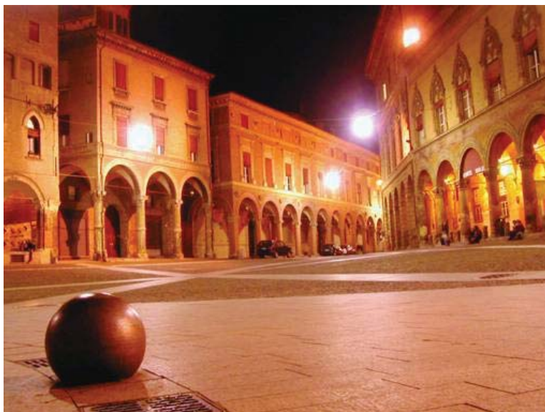
Bologna at night