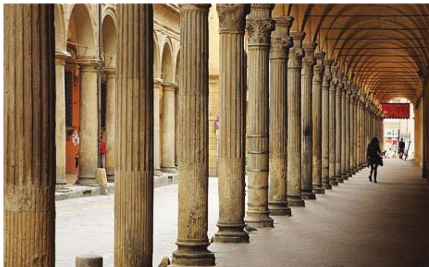
Bologna's signature arcaded walkways